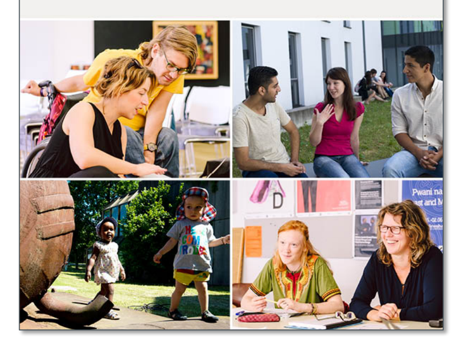
™ <u>WWW:</u> overview of services and support ™